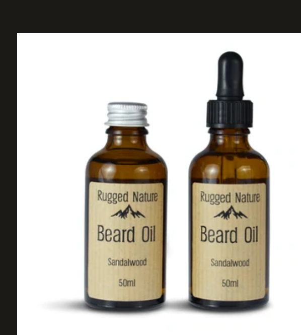
100% Natural Beard Oil 50ml (All Scents)