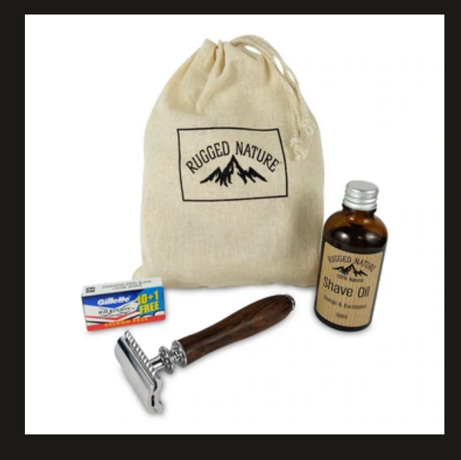
Rugged Nature Oil Shave Kit