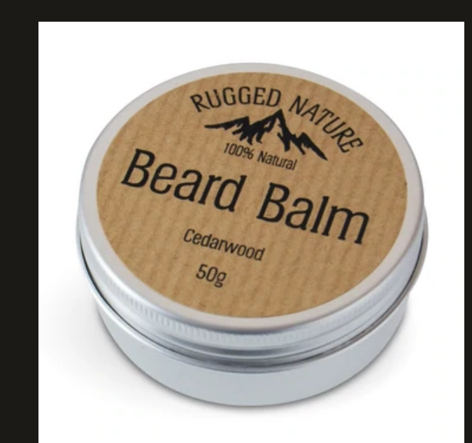
100% Natural Beard Balm 50g (All Scents)