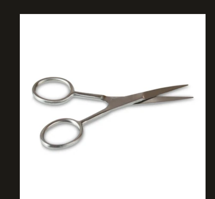
Beard Trimming Scissors