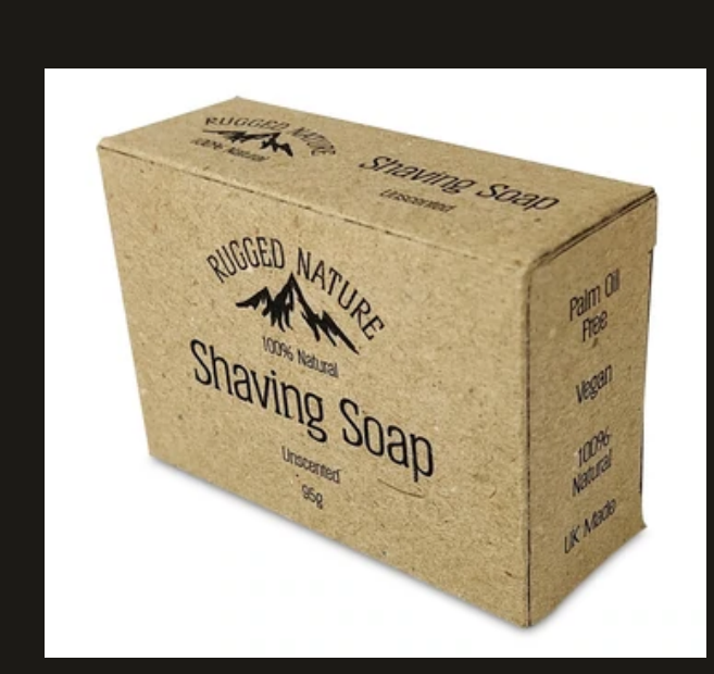
Rugged Nature Shave Soap