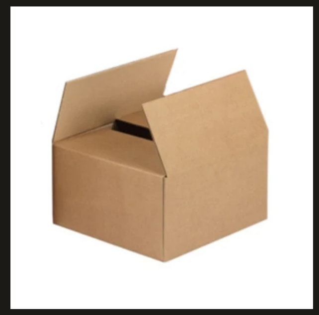
Beard Oil (Case of 9 Units)