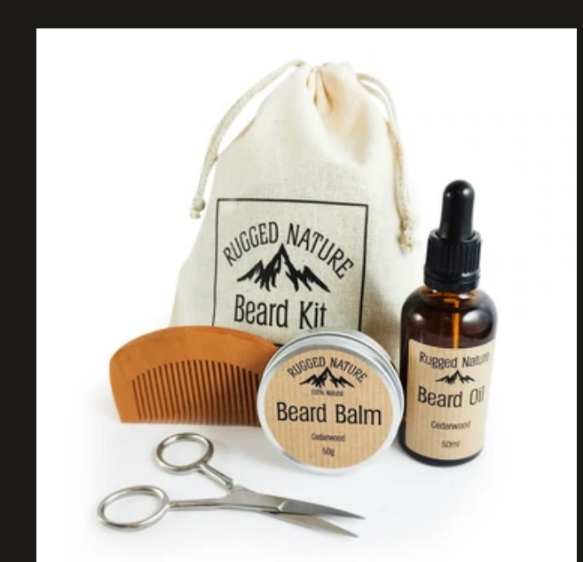
Rugged Nature 100% Natural Beard Kit