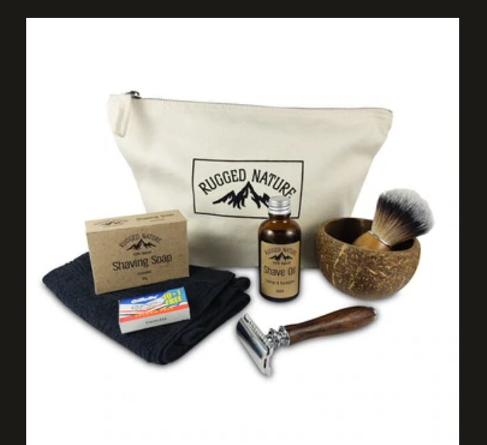
Rugged Nature Ultimate Shave Kit