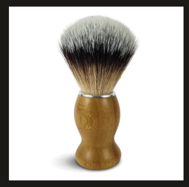
Rugged Nature Shaving Brush (New Bamboo Handle)