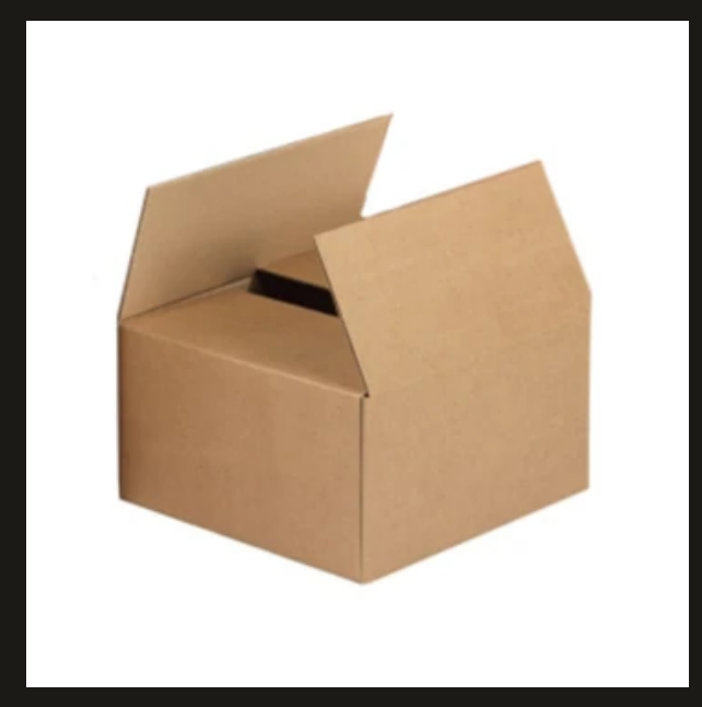
Beard Balm (Case of 10 Units)