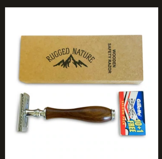
Rugged Nature Safety Razor (Best Seller)