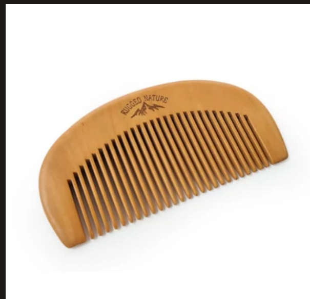
Small Wooden Comb