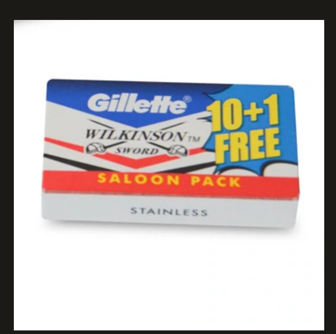
Pack of 10 Stainless Steel Razor Blades