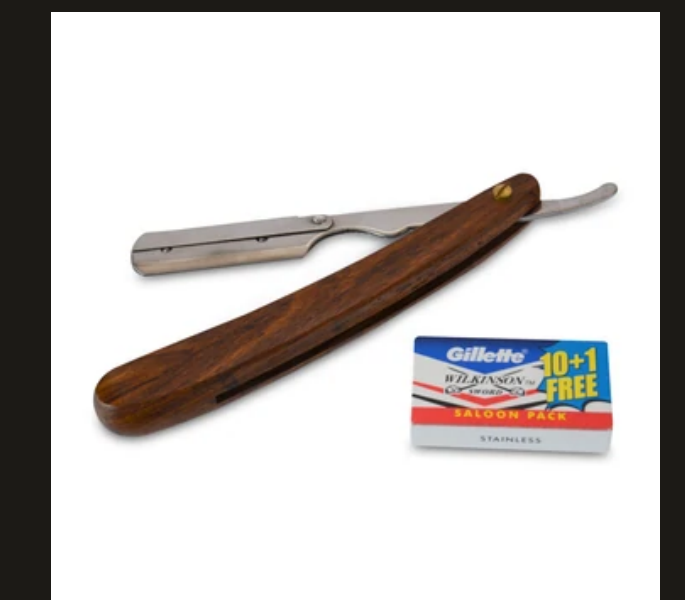
Rugged Nature Straight Razor